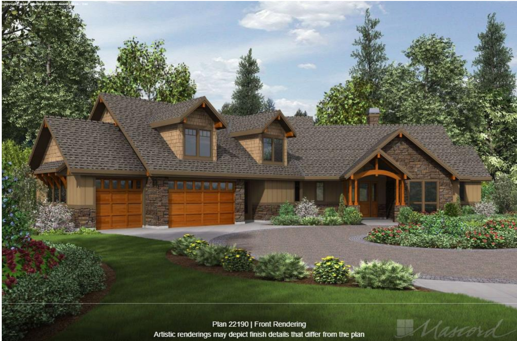
Plan 22190 | Front Rendering

Artistic renderings may depict finish details that differ from the plan